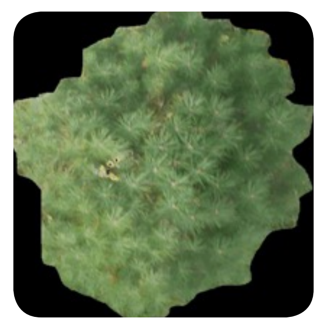
Figure 3. Example of automatic segmentation of Pinus pinea pinecones.